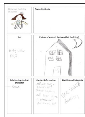
Figure 1 – Example Character Template

Within their groups the children were asked to create their own characters for a story about this festival, one living character and one dead. Each group was provided with two paper templates (see Figure 1), which they could fill in with information about each character such as their hobbies/interests, job, and relationship to the other character. Example templates, based on the story that was told to the children earlier, were displayed on an interactive whiteboard as a prompt for groups who were struggling to think of ideas for their characters. Once the children had agreed on their two characters they were then provided with modelling clay as well as a selection of other art materials and asked to build or draw each of their characters. Next the children were asked to create a story about their characters, focusing on why and how one character wants to contact the other character, what they want to say to them and to think about how the story could end. Each group was provided with a blank paper storyboard on which they could document their ideas for their story. Lastly each group was given a Flip video camera and asked to capture their story on this to enable the researchers to share the children’s story ideas with the game development team. Due to the setup of the workshop it was not possible to video record the sessions, therefore each of the researchers took written notes to document their observations across teams.