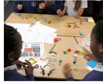
Figure 3 – Children creating their clay model characters

them at all. There was evidence of four groups using some level of verbal improvisation when filming their story, with some children modifying their original story plan and others generating the majority of the storyline from scratch during this phase.